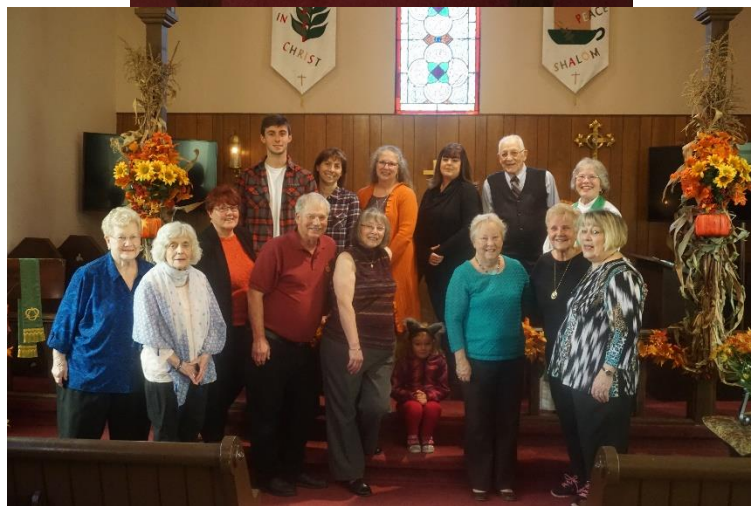
Halloween, October 28 th