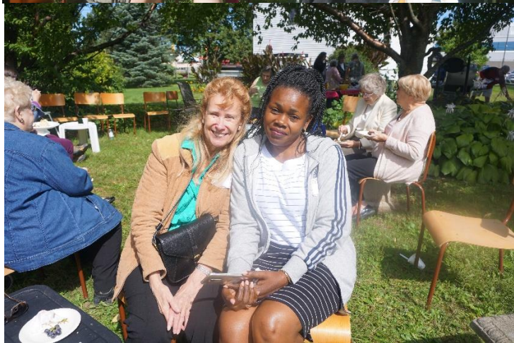
Thanksgiving, October 7 th