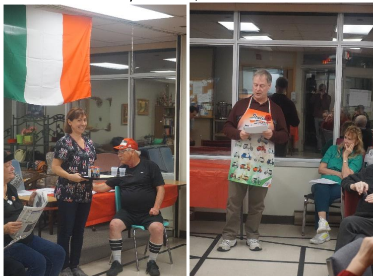
Death by Tiramisu, November 10 th