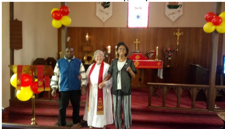
Doors Open, June 2 nd and 3 rd