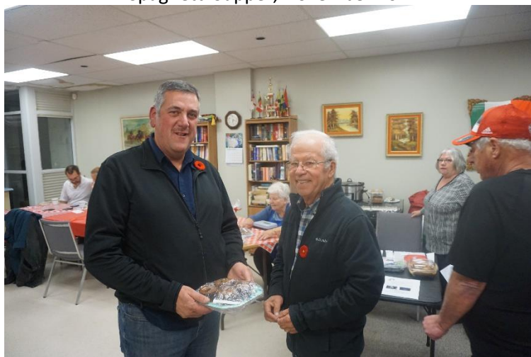
Spaghetti Supper, November 10 th