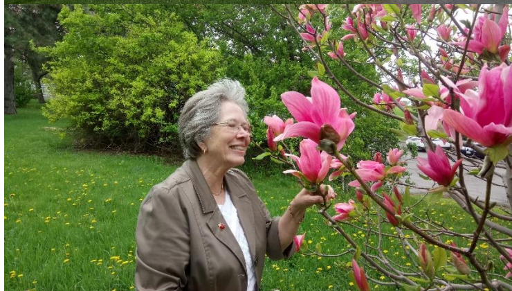
Pentecost Sunday, May 20 th