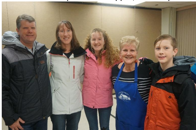
Shrove Tuesday Pancake Supper, February 13 th