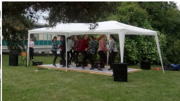
Summer Market, June 26 th